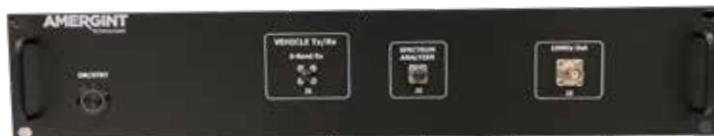
Sample Front Panel