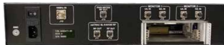
Sample Back Panel

Custom front and back panels are assembled for your specific configuration.